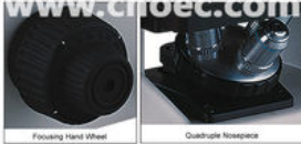
Focusing Hand Wheel